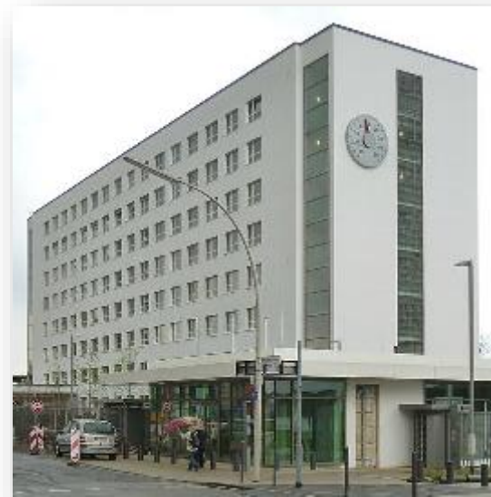
Global DNA Forum Meeting 2019 venue in Bonn