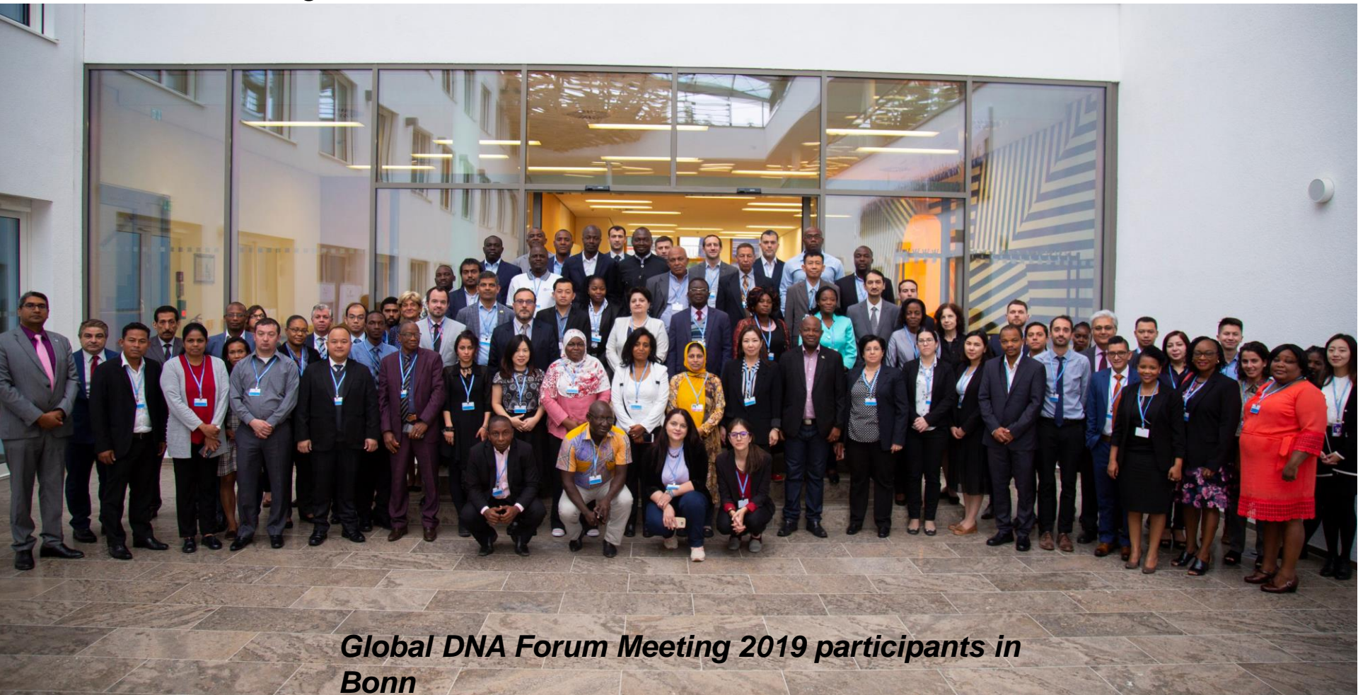
Global DNA Forum Meeting 2019 participants in Bonn